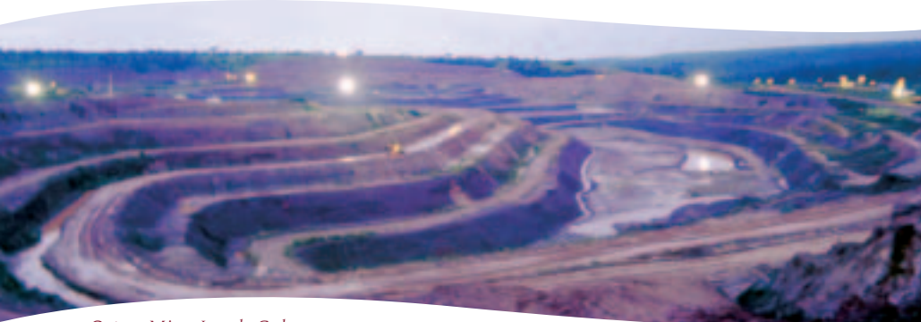
Catoca Mine, Lunda Sul.

In 2003, Angola ranked 164 th on the UN Human Development Index, which conflates per capita income, literacy, infant mortality and life expectancy. A country slightly bigger than France, Angola is lightly populated. Although no recent census has been undertaken, the population is estimated between 12 and 16 million. The wars, however, have driven much of the rural population into the towns, with a quarter to a third of the population living in Luanda alone – now a city of four million people.