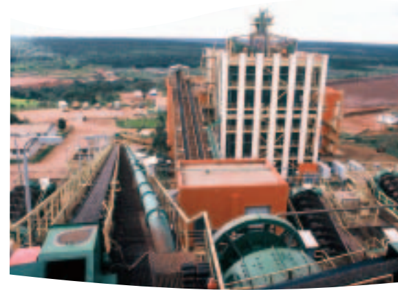
Catoca Plant, Lunda Sul

Currently, Luzamba is the only formal alluvial mining operation producing diamonds in the Cuango region. All other diamond production is from artisanal mining, although new industrial-scale projects are expected to come into operation. SDM produced $177 million of diamonds in 2003, but its present concession is expected to be exhausted in 2004.