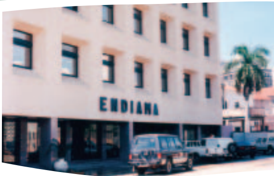
ENDIAMA, State Mining Company in Luanda

UNITA rejected the subsequent election results and, in October 1992, went back to war and seized most of the diamond fields. Only one formal government-run mine continued to work throughout the next three years, although others were able to operate sporadically. During this period, UNITA was the major producer of Angola diamonds, producing and smuggling as much as 90 per cent of the total reported production. State production and exports fell to $28 million in 1993, was close to $60 million in 1994-5 and only began to rise again in 1996, when these reached $147 million, after UNITA surrendered mining areas and the Lusaka Peace Accords began to be implemented.